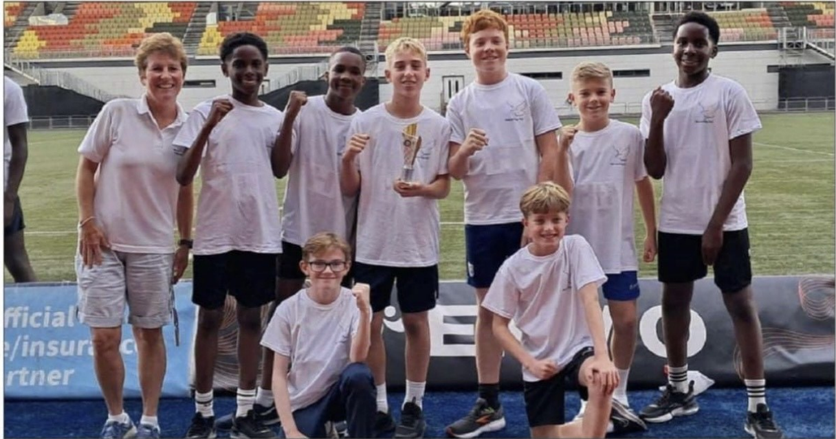
Havering AC Under-13 boys team celebrate their win

y i t a n n - t - d r d n - f h s e - t - 8 t - s h d t l - t