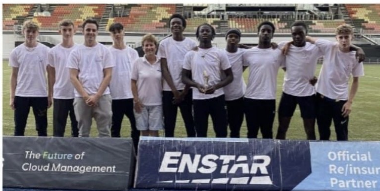
Havering's under-17 boys won their age group

The summer season ends for most club athletes as Havering host their annual end of season club championships and open meeting at Hornchurch Stadium on Sunday with over 150 club athletes among the 250-plus entries.